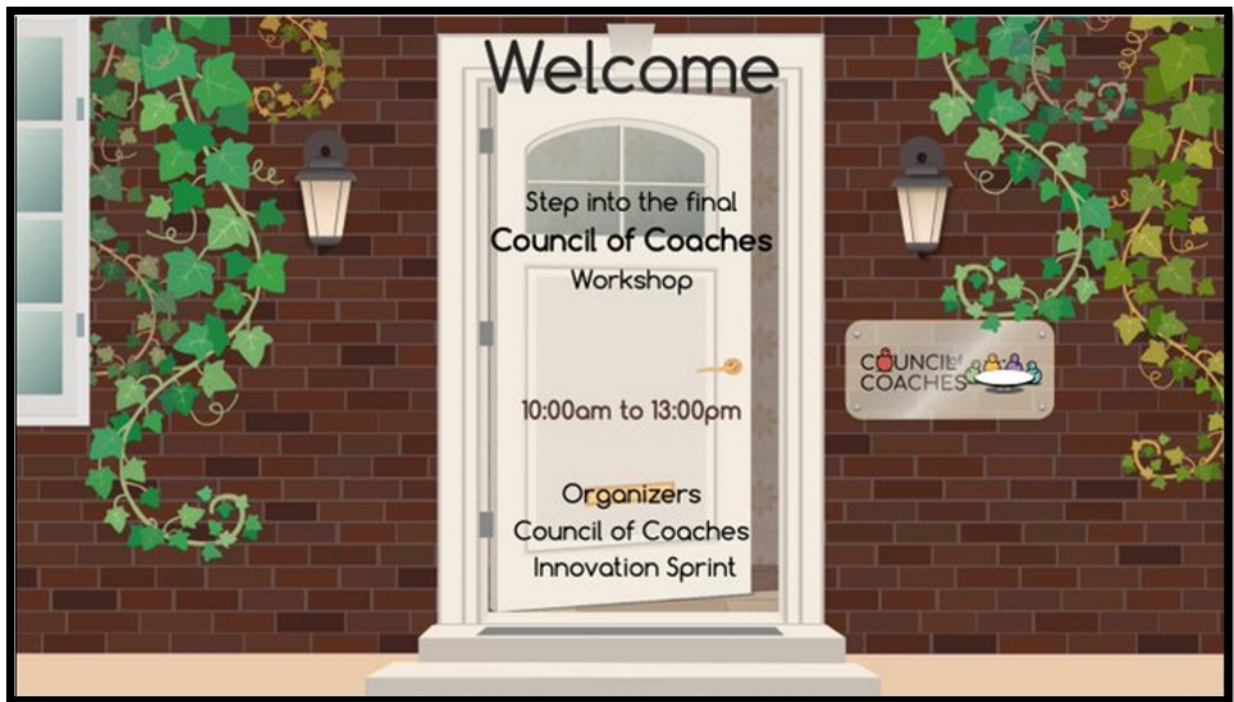
Figure 2: ZOOM platform welcoming slide, while participants were slowly joining the call.

On the morning of July 8 th , 2020, we've opened our online ZOOM session and eagerly waited for our audience to start joining the call (see Figure 2). As stated earlier, there were 85 virtual tickets "sold", but from experience there could be a big difference between this number and the actual number of participants.