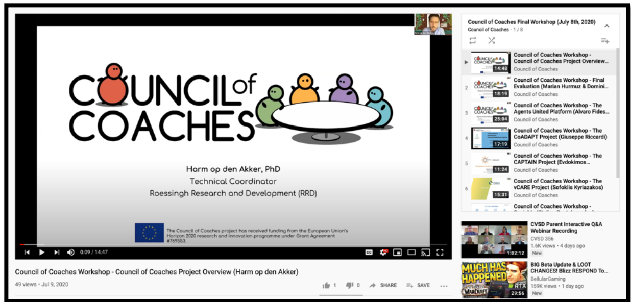
Figure 5: Screenshot of the COUCH Workshop playlist on the Council of Coaches YouTube channel.