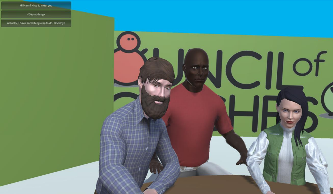
Figure 1: Screen capture from the functional prototype. Three coaches and buttons for interaction in the upper left corner.